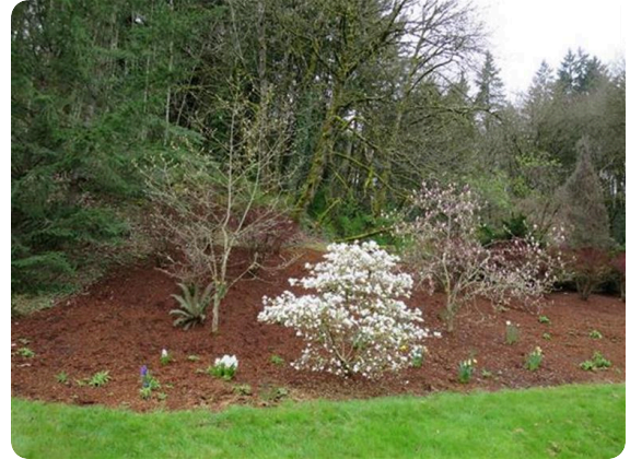
Those beautiful trees now.