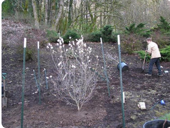
Ian planting magnolia trees.